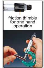
friction thimble for one hand operation